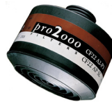
▶ DT-4031E 3M™ Combination Filter A1P Protection