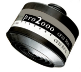
▶ DT-4032E 3M™ Combination Filter B2P Protection