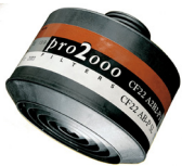
▶ DT-4035E 3M™ Combination Filter A1B2P Protection