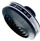
▶ DT-1235E 3M™ Particulate Filter (reduced opening) P R SL Protection