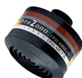
▶ DT-4036E 3M™ Combination Filter A1B2E1P Protection