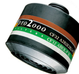
▶ DT-4045E 3M™ Combination Filter A1B2E2K2P Protection