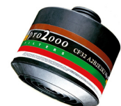
▶ DT-4046E 3M™ Combination Filter A1B2E2K2HgP Protection