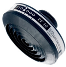
▶ DT-1135E 3M™ Particulate Filter P R SL Protection

Different tasks require different protection. 3M™ filters, DT Series help protect against particles such as dust and debris, along with certain gases and vapours.*